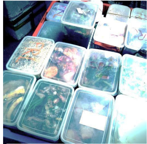
Food waste collection