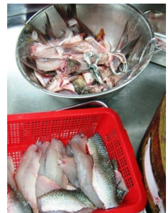
Reuse food trimmings (e.g. use fish bone for soup)