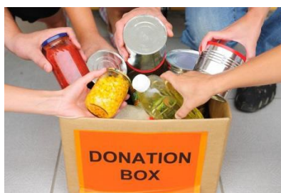
Donate surplus edible food to charitable organizations