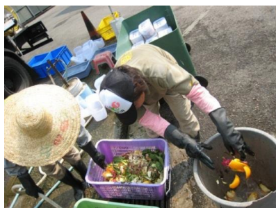
Train the Environmental and Hygiene contractors to separate recyclable food waste