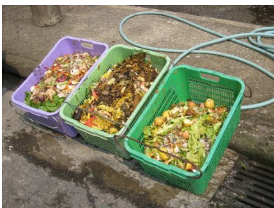
The Environmental and Hygiene contractors should separate non-recyclables from the collected products