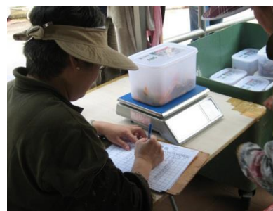
Weigh the food waste