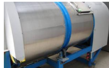
Set up food waste collection points