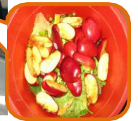
Separate food waste for recycling