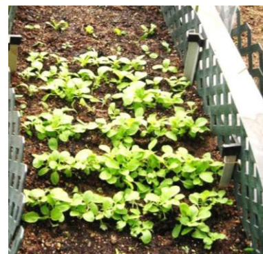
Use the recycled compost in landscaping